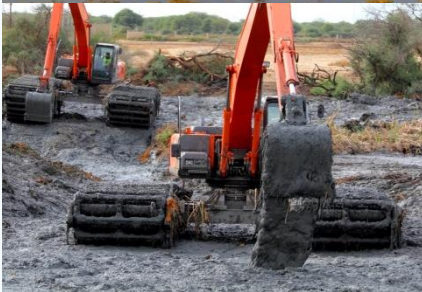
Hitachi and Caterpillar Swamp Excavator