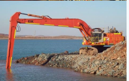
Hitachi EX1800 3-piece Boom