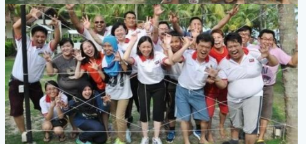
Experiential learning and team building