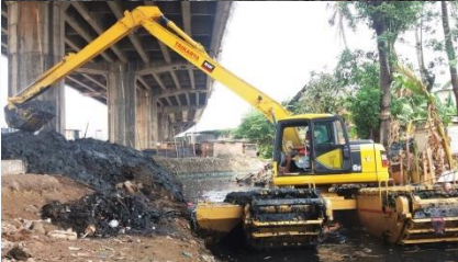
Canal clean out by Amphibious Excavator