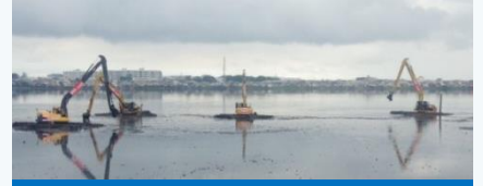
Before and after the clean out