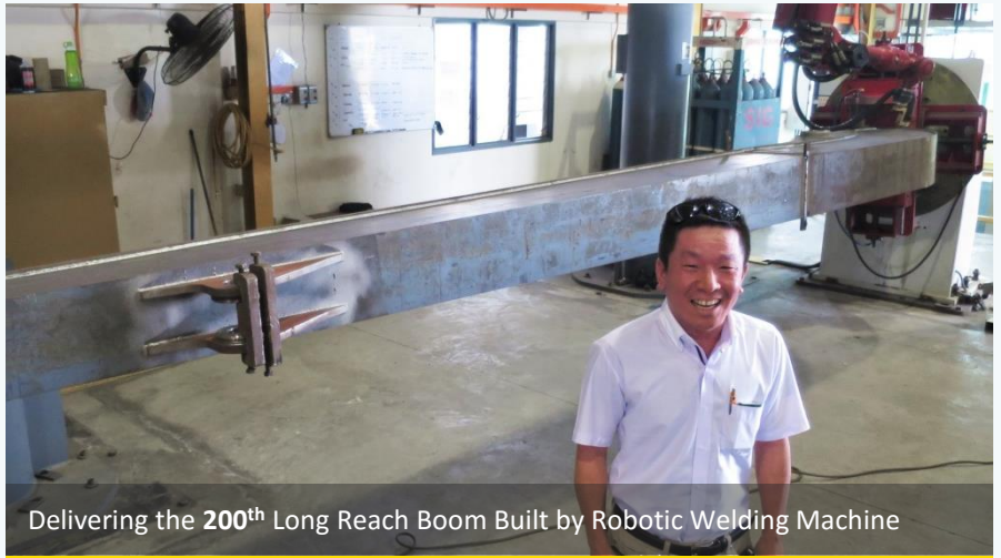
Delivering the 200 th Long Reach Boom Built by Robotic Welding Machine

We build with Pride, You use with Trust.